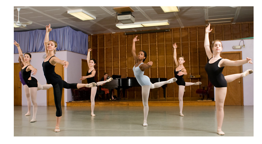
Belvoir Terrace Camp Dance Studio