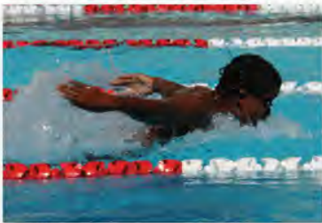
JUSTIN - "Full of Justice"

The Lord is good, a stronghold in the day of trouble; and He knoweth them that trust in Him. Nahum 1:7